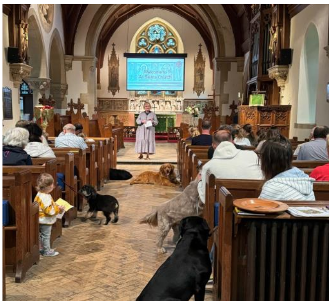
Some of our four-legged friends at this year's Pet Service